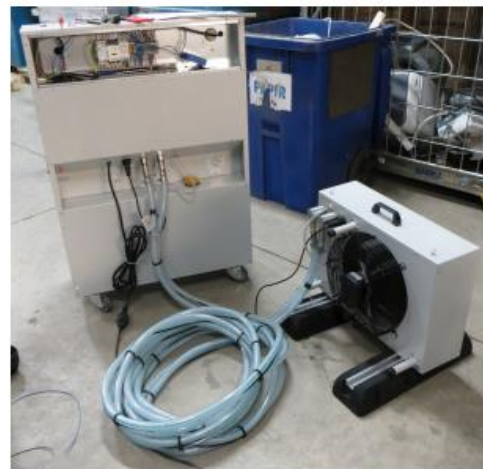
Slange sett er ferdig fylt, er 10 meter og inneholder også elkabel og kondensslange